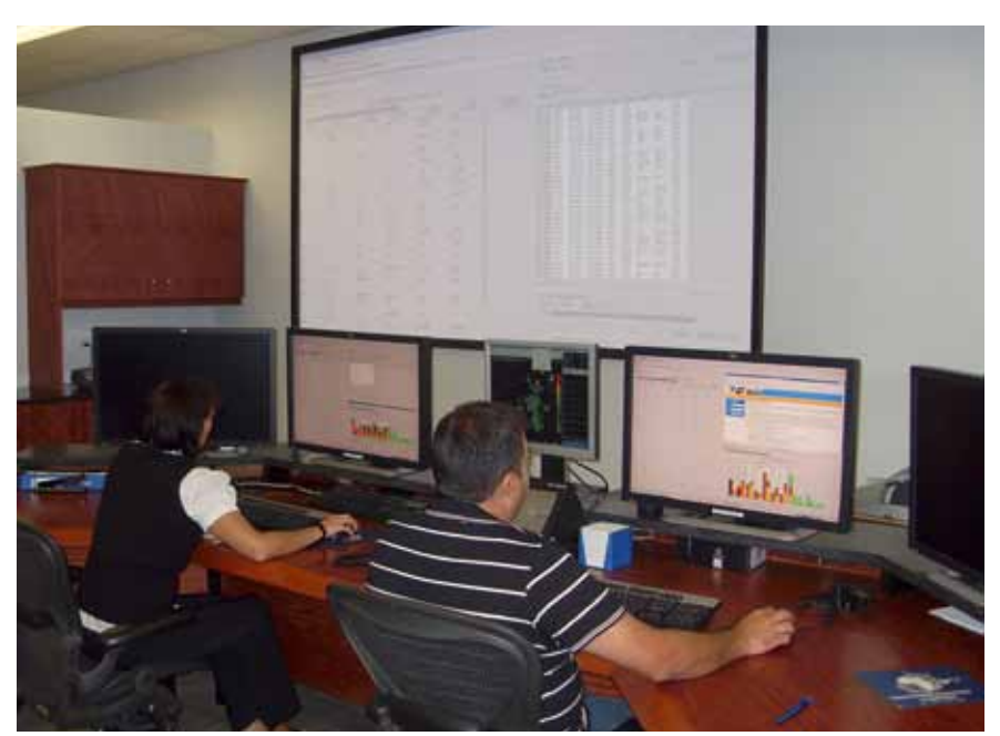
ATNS Traffic Flow Managers utilizing Metron Traffic Flow at CAMU. ATNS is responsible for Air Traffic Management in approximately 10% of the global airspace. Operating at 20 aerodromes within the country, ATNS manages about 685,000 arrival and departure movements per year.

Given the consolidated process provided by the Thales and Metron technology, South African airspace and airport facilities are better able to calculate aircraft trajectories and accommodate the aircraft operator's requirements, and are thus, better equipped to handle the volume of traffic and other circumstances surrounding the world's premier football tournament.